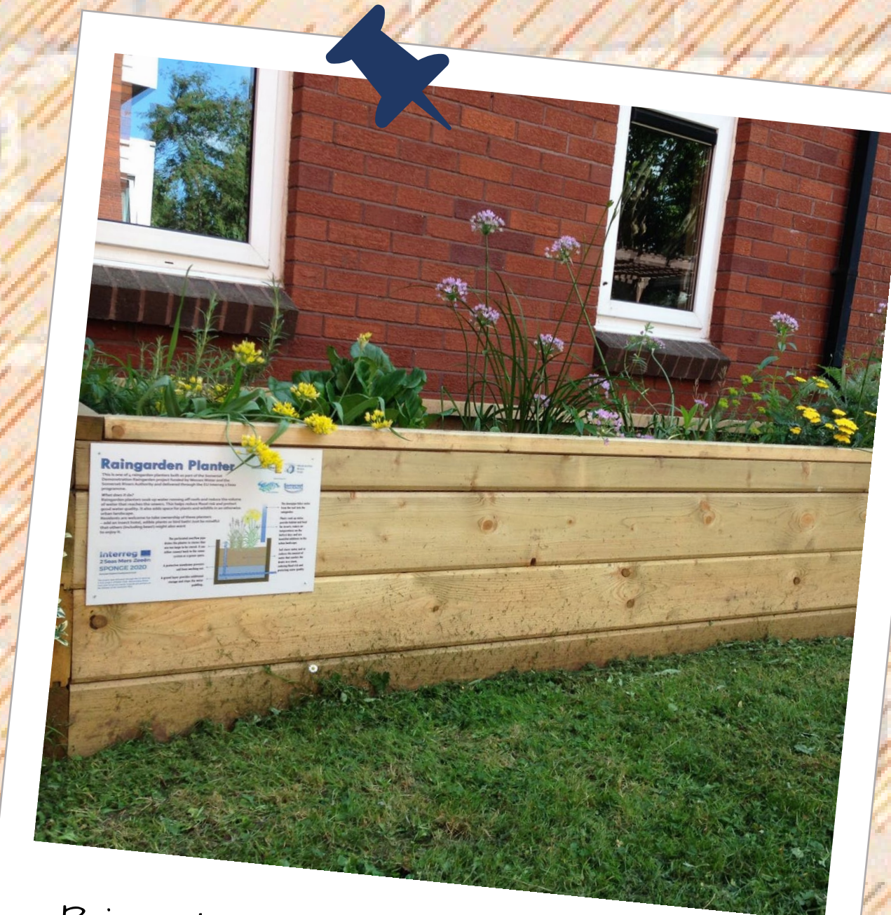
Raingarden planter created with residents