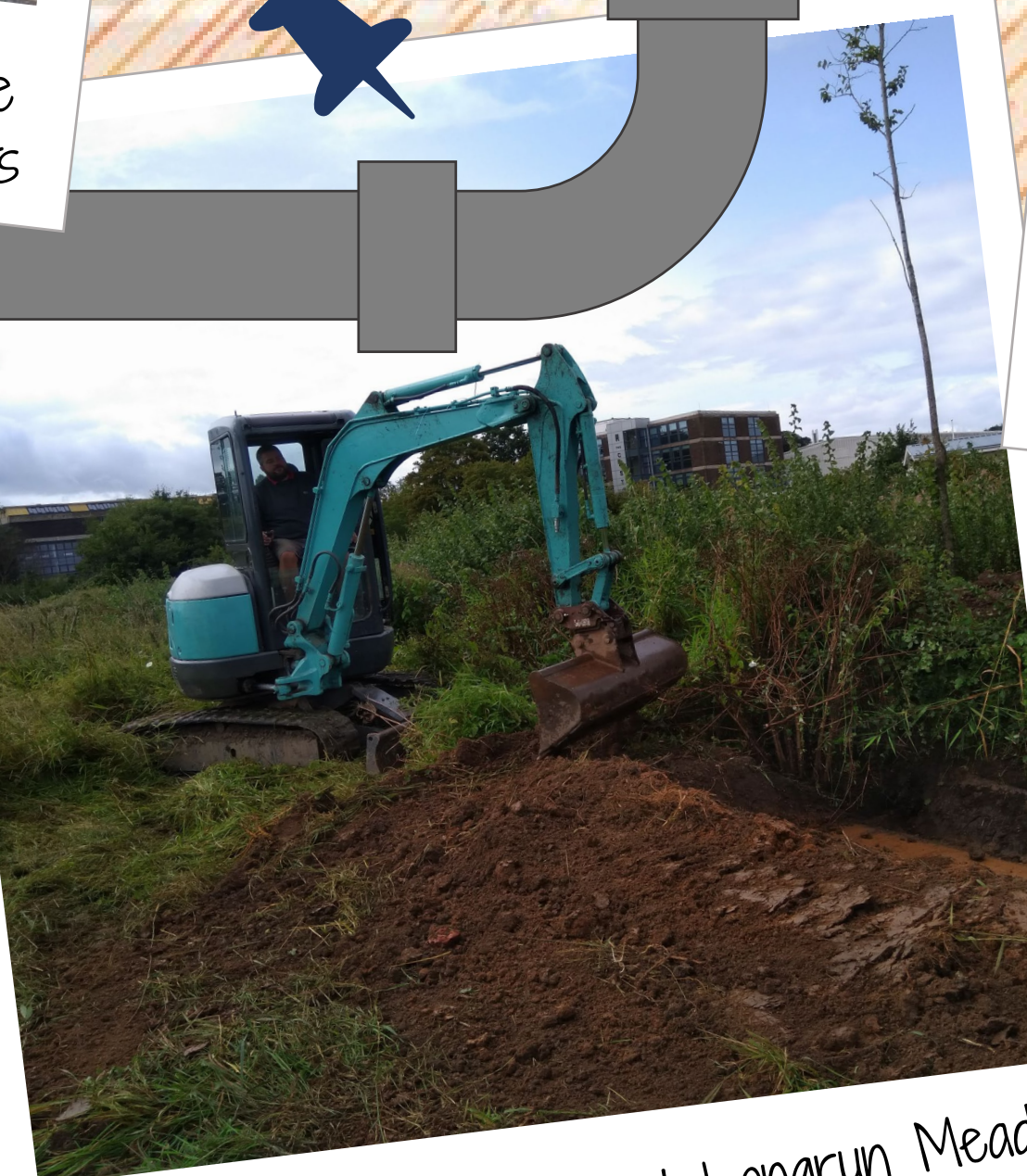
Building retention ponds at Longrun Meadow

Outcome: The finished raingarden is now an accessible and interactive part of the school grounds, with interesting colours, textures and smells creating a sensory and educational space, while also reducing the risk and impact of surface water flooding.