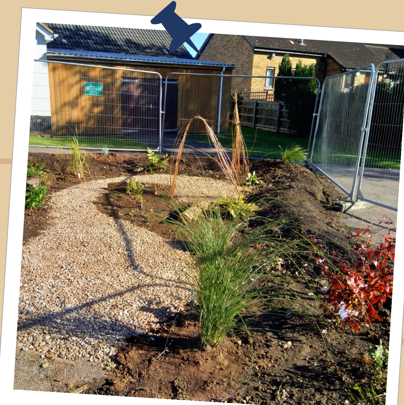
Finished raingarden at Selworthy school