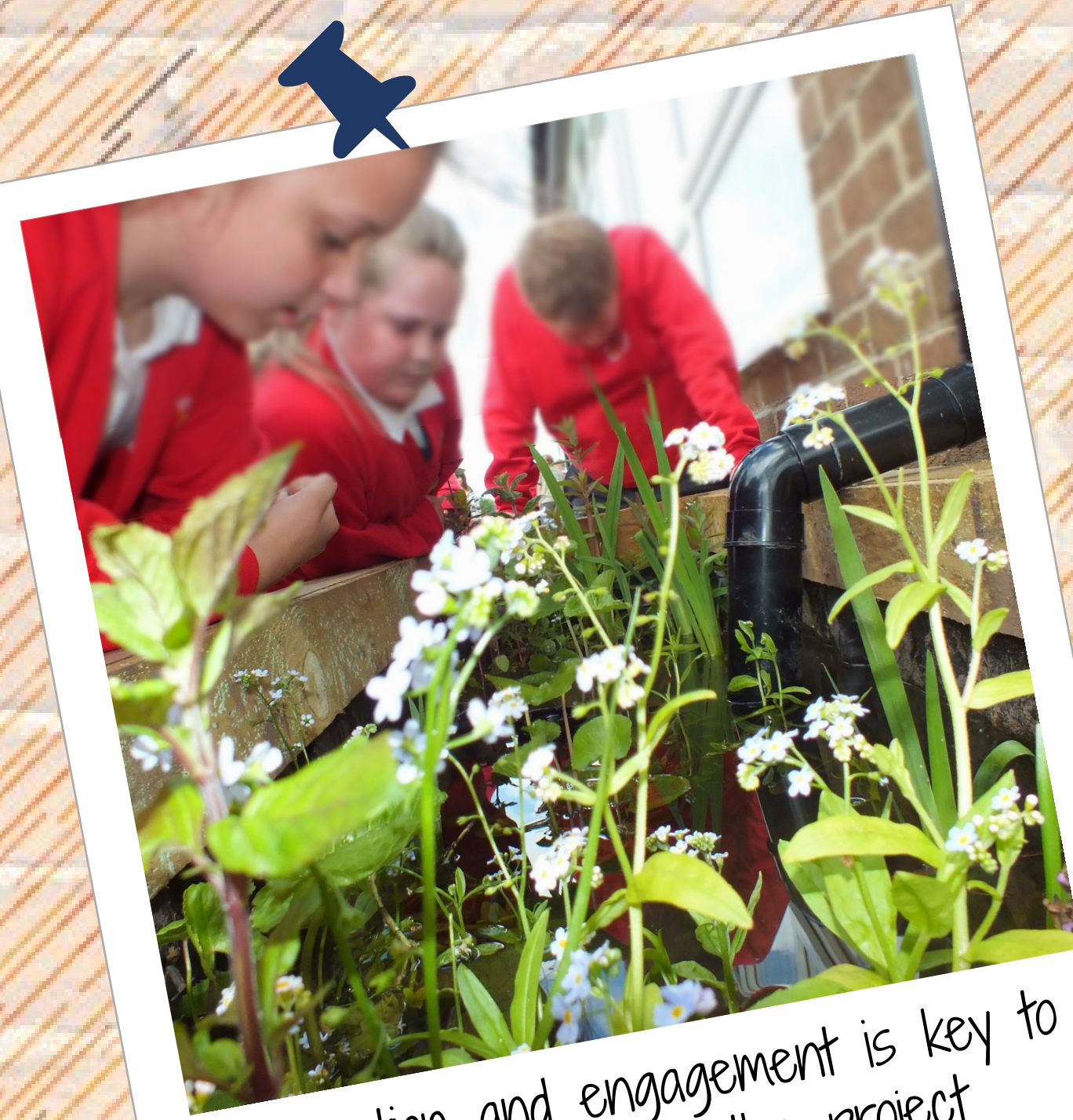
Education and engagement is key to the success of the project

Focus areas were chosen strategically to provide maximum benefits, based on social, environmental, cultural and economic data. The resulting focus areas coincided with areas low on the Index of Multiple Deprivation.