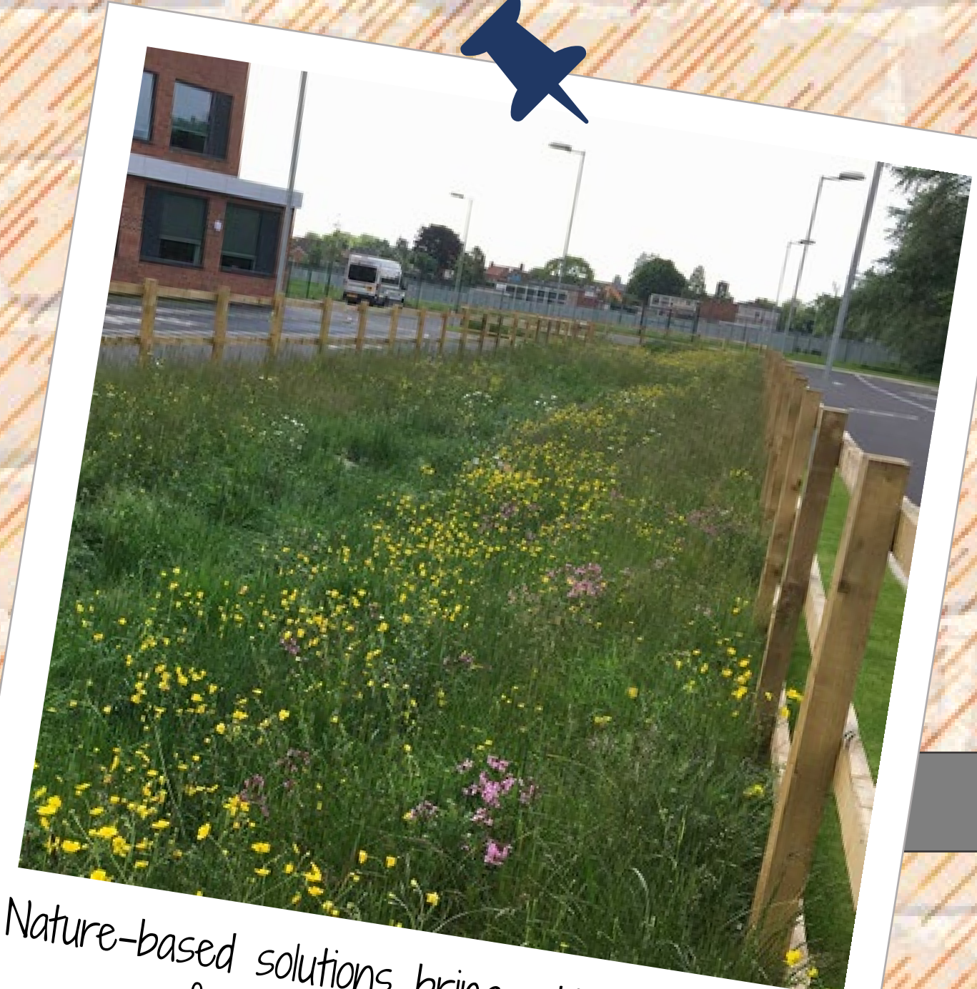
Nature-based solutions bring additional benefits for aesthetics and wildlife

Our work is evidence-led, participatory and place-based – community involvement and using local knowledge is essential.