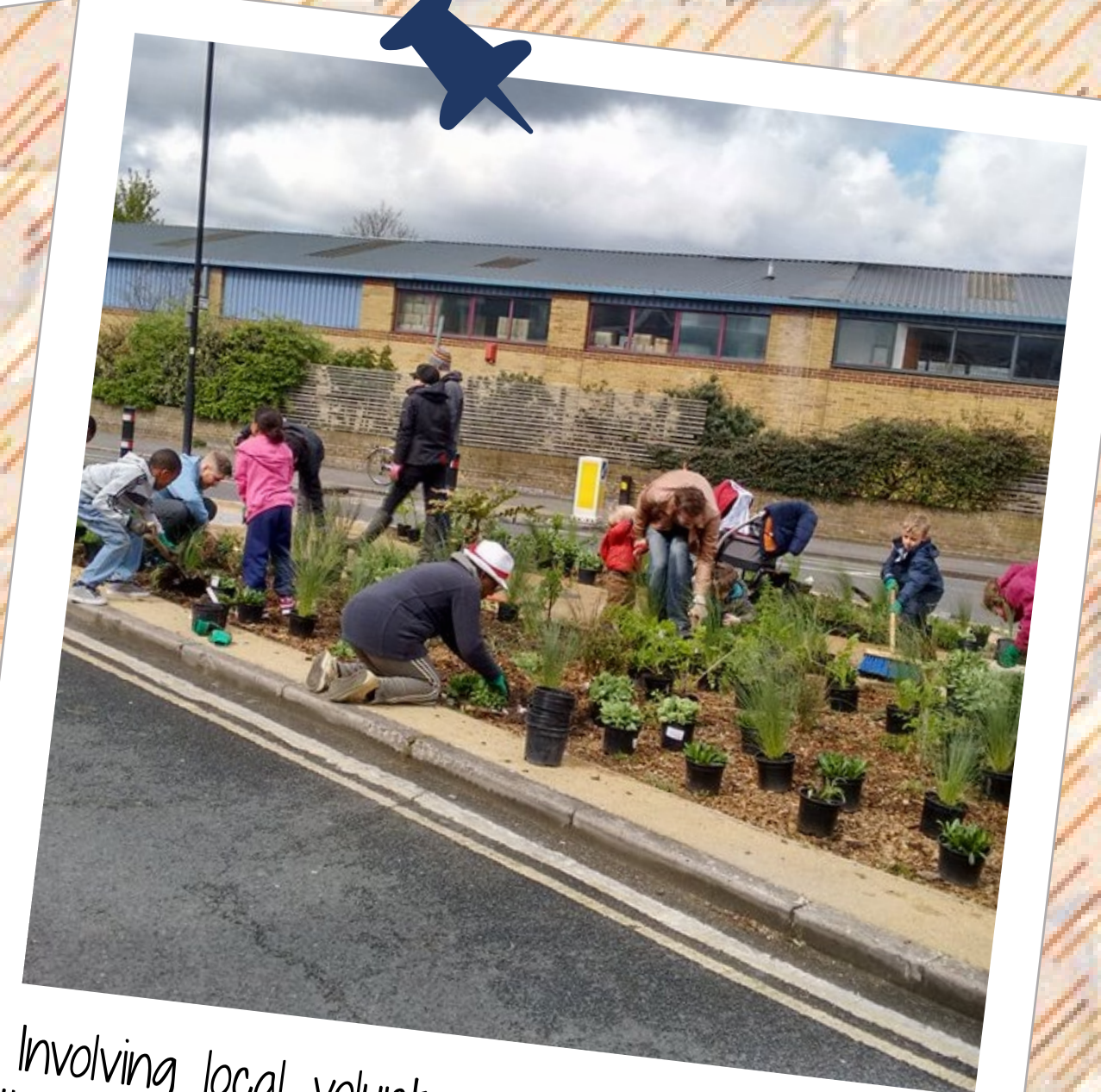
Involving local volunteer groups helps ensure the long-term success of the project outputs